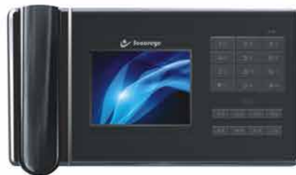
S-IP5000GU 5.6" LCD screen Guard Station, Luxury Metal - Rimmed Appearance