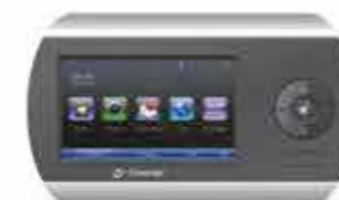
S-4LCD 4.3" TFT - LCD Intercom System