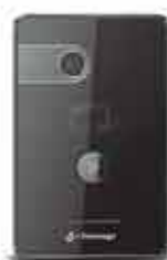
S-IP60 Front door station