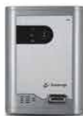
S-IP50 Front door station

The IP is an intelligent video intercom & home automatic system which is based on TCP/IP technology. It's powerful in intercoms and convenient in installation. Unlimited number of indoor monitors and outdoor stations. Unlimited number of indoor monitors and outdoor stations make the system flexible and expandable. All video, audio and data are simply transmitted by just a CAT-5 cable, therefore, there is no need to handle with those complicated wiring and numerous relays, decoders, adapters, etc.