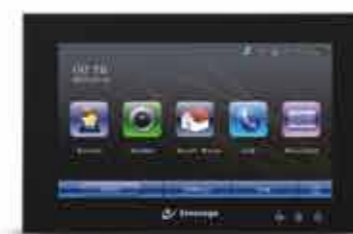
S-9LCD 9" TFT - LCD Video Intercom System