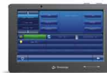
S-10LCD 10" TFT - LCD Intercom System