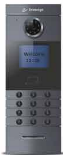
S-TW1000 IP Multi Apartment System