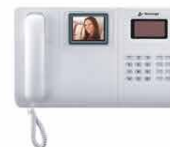
S-GU2000 Guard Unit