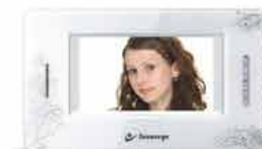
S-4LCD 7" TFT - LCD Intercom System